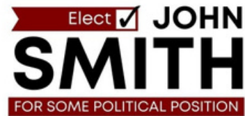
Canva Logo Templates