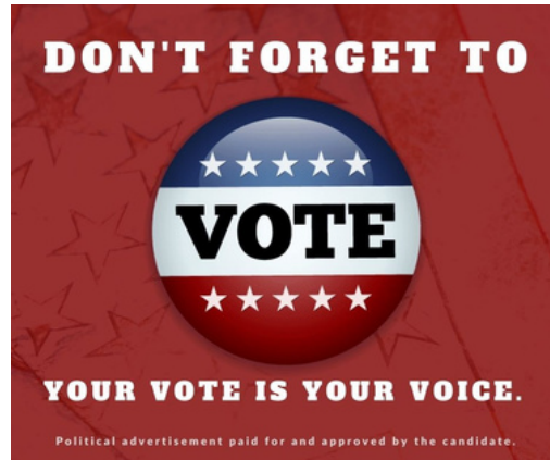
Facebook Post Template