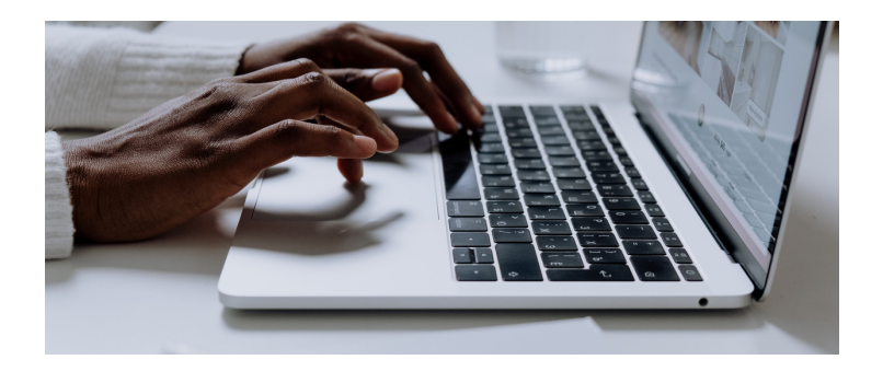
Campaign Website Meets Text Messaging