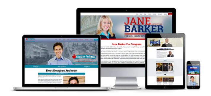
Campaign Website Meets Text Messaging